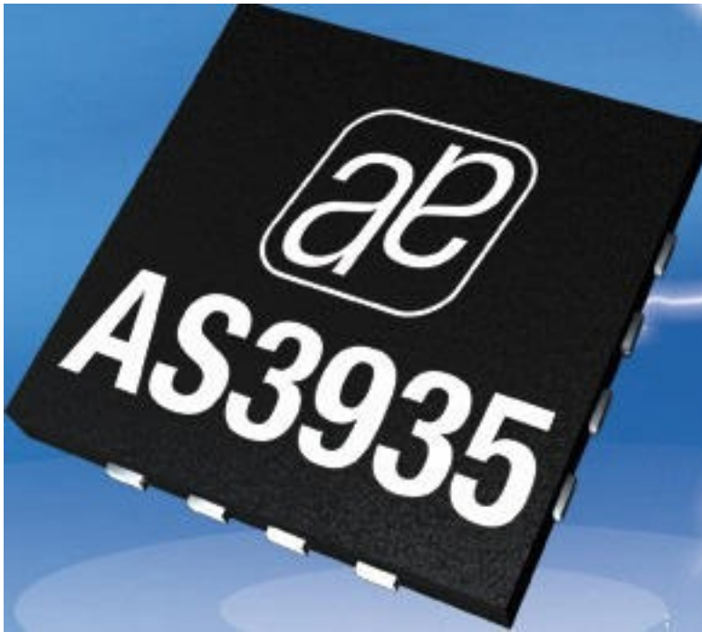
Bruce Ulrich, Wireless Product

Line Director, ams: We have seen a migration of sensors from the industrial to the consumer space. Similar to how DSP migrated from defense to consumer, we are seeing sensor technologies that were refined in industrial applications find new homes in portable devices. These new applications increase the need for low power as well as no load on the microcontroller. This requires sensors designed for each application to include the unique microcode required to operate independently in that application. In other words, smart sensors.